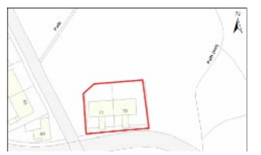
Red line plan: Leiden Road