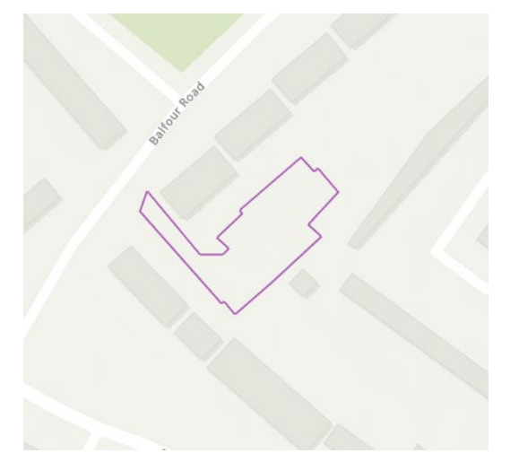
Red line plan: Balfour Road